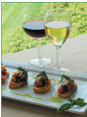
Enjoy bruschetta and wine... Weekdays at 4